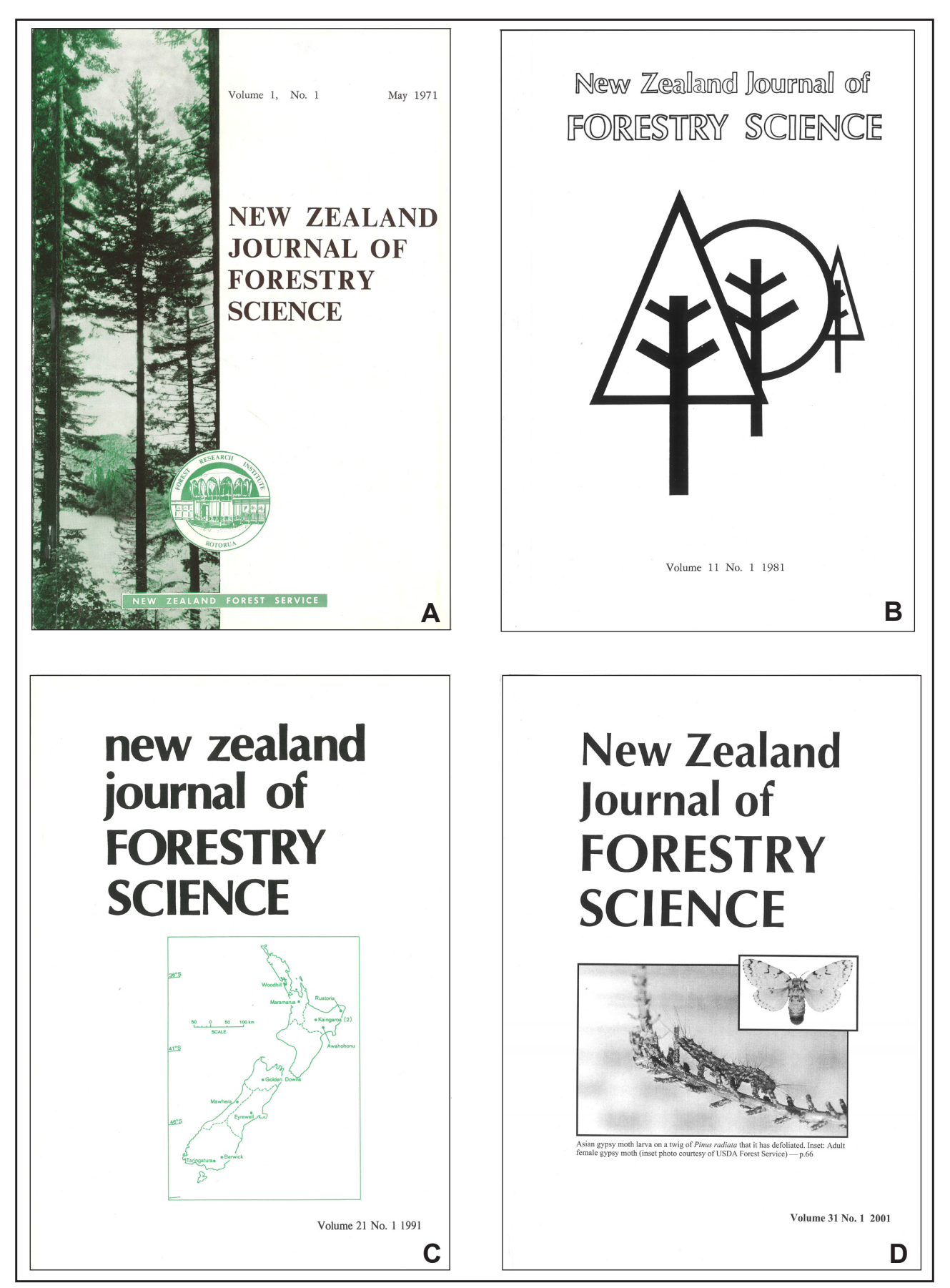
FIGURE 2: Cover designs for four different issues of the New Zealand Journal of Forestry Science . (A): Volume 1, Issue 1, 1971; (B) Volume 11, Issue 1, 1981; (C) Volume 21, Issue 1, 1991; and (D) Volume 31, Issue 1, 2001.