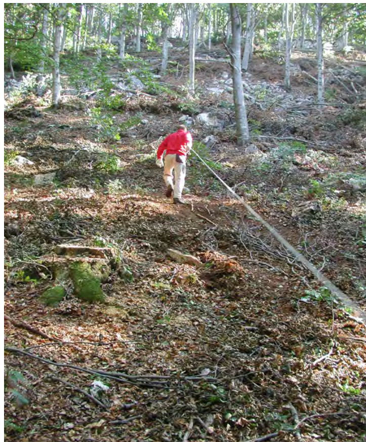
Figure 13: Synthetic rope - showing ease of haul out up a steep slope.

The key advantage of some synthetic rope is its similar strength to wire rope of a similar diameter while only a fraction of the weight (approximately 1/9 th ). More synthetic rope can be spooled on to winch drums compared with wire rope because of its improved spooling and compaction. It also lacks the torsional energy of wire rope and doesn't have sprags. Operators find synthetic ropes easier to handle and less energy is required to haul rope out across difficult terrain making it easier to haul these ropes out over greater distances than conventional wire rope (Ewing, 2003; Pilkerton et al., 2004) (Figure 13). In conventional ground-based operations replacing the main winch rope with synthetic rope is estimated to increase productivity by around 10% through the increase in number of drags per day, the reduction in machine positioning time because of the greater haul distances achievable with synthetic rope and fewer delays in spooling rope onto the winch drum (Pilkerton et al., 2004).