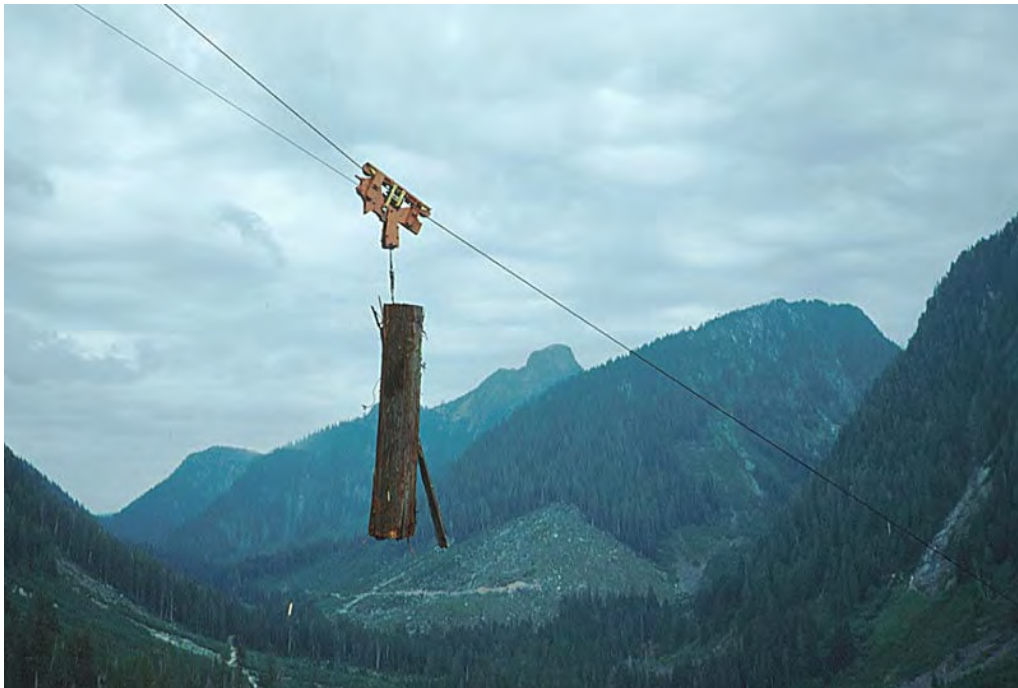
Figure 7: An example of full suspension using a Wyssen skyline system. South coastal British Columbia, Canada.

Skyline hauler systems are commonly used overseas (Figure 7) and in New Zealand's steep terrain to harvest particularly sensitive areas. In one example in New Zealand, a skyline system was used to harvest a sensitive area of steep dissected terrain, with erodible soils, remnant indigenous vegetation in the gullies and streams flowing into a trout fishery river (Palmer, McMahon, Fraser, & Visser, 1996). The lateral pulling ability of an Eagle II motorised slack pulling carriage meant that only one extraction corridor was needed across the gully to harvest the 5.5 ha block. By achieving full suspension across the gully, damage was limited to 3% of the vegetation, the stream was protected and soil disturbance confined to a spur beneath the skyline.