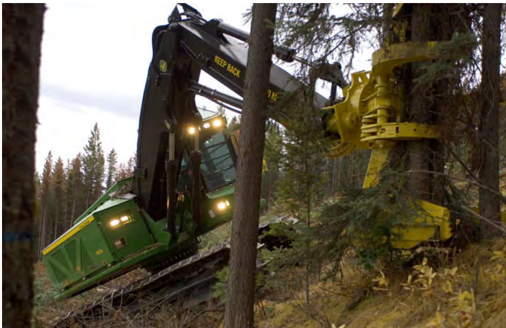
Figure 5: John Deere 903J tracked feller buncher operating on steep terrain.

Research in North America has also investigated the use of tracked machines (particularly small crawler tractors) on steeper slopes traditionally harvested by cable yarders (McMorland, 1980; Krag & Webb, 1987; Krag, 1991; Sauder, 1998). A study on small crawler tractors in British Columbia, Canada, operating on slopes up to 40°, and using contour tracking 30 m apart, found site disturbance by these machines was approximately one-third less than conventional skidders and tractors (McMorland, 1980). The authors attributed most of this to the narrower tracks and wider spacing of the track network. Small crawler tractors were most cost-effective on slopes greater than 17°.