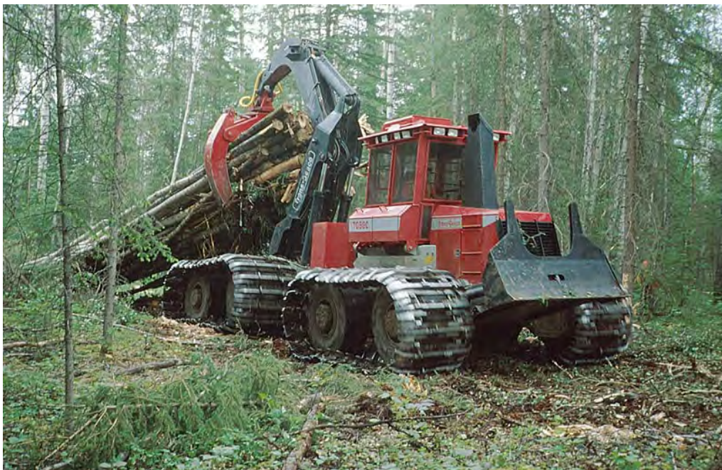
Figure 3: Trans-Gesco TG88C operating on moist fine-textured soils, Alberta Canada.

However, care is needed in the use of these machines. Aust, Reisinger, Stokes & Burger (1991) showed that while wider tyres reduced soil disturbance and compaction, the impact could still be significant. At one site, wide-tyred machines increased the area of soil disturbance because of their ability to access a greater proportion of the total site. Trials on a range of forest soils in British Columbia, Canada also found that while wide-tyres reduced soil compaction, levels were still high enough to potentially affect site productivity into the next rotation (Rollerson, 1990). Wide tyres are more expensive than traditional tyres, and they can reduce machine manoeuvrability. There can be difficulties in fitting the wider tyres to existing machines and the extra weight increases the stress on the machine. Although suited to New Zealand's terrain and conditions, at the time of Hall's (1998) report wide tyres were not commonly used in this country.