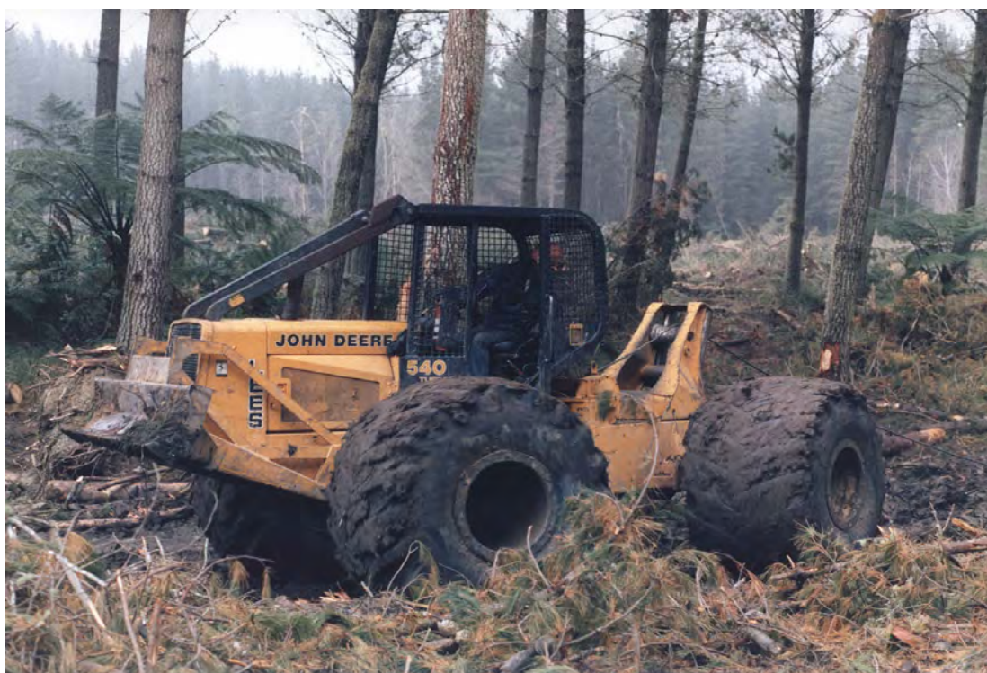
Figure 2: Example of a wide-tyred skidder extracting timber after a 44 mm rainfall event.

While wide-tyred machines show little or no advantage over traditional tyres on dry, stable soils (Spiers & Cody, 1985), machines equipped with wide, flexible, low pressure, high flotation tyres can improve productivity and environmental performance on sensitive soils (Figure 2). Studies in New Zealand and overseas have demonstrated a reduction in soil disturbance and compaction using wide-tyred machines (Spiers & Cody, 1985; Hall, 1998; Stokes & Schilling, 1997; Prebble, Blundell, & Robertson, 1989). Soil disturbance can be further reduced with the retention or placement of logging slash along access routes (McMahon & Evanson, 1994).