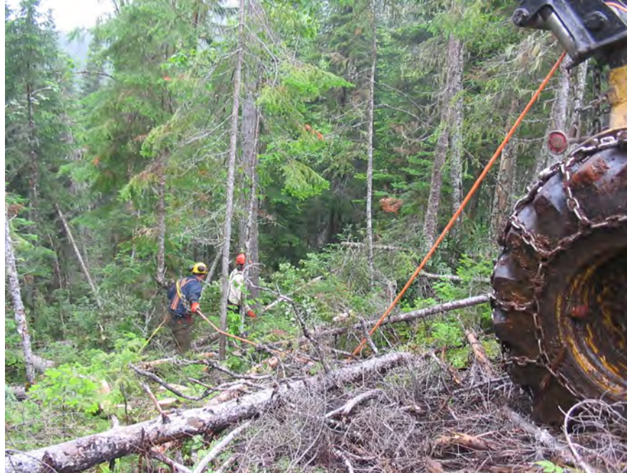
Figure 12: Demonstration of synthetic rope on a skidder to a group of cable loggers in Quebec, Canada.

Replacing steel wire rope with synthetic rope is gaining some acceptance in the forestry industry, particularly in North America and Europe. While primarily used in ground-based operations (Figure 12), synthetic ropes are extending into other areas such as chokers, securing loads on trucks and as guylines and other static line in cable harvesting operations (Ewing, 2003; Pilkerton, Garland, & Hartter, 2004; Hartter, Leonard, Garland, & Pilkerton, 2006; Spong & Wang, 2008) (Figure 8).