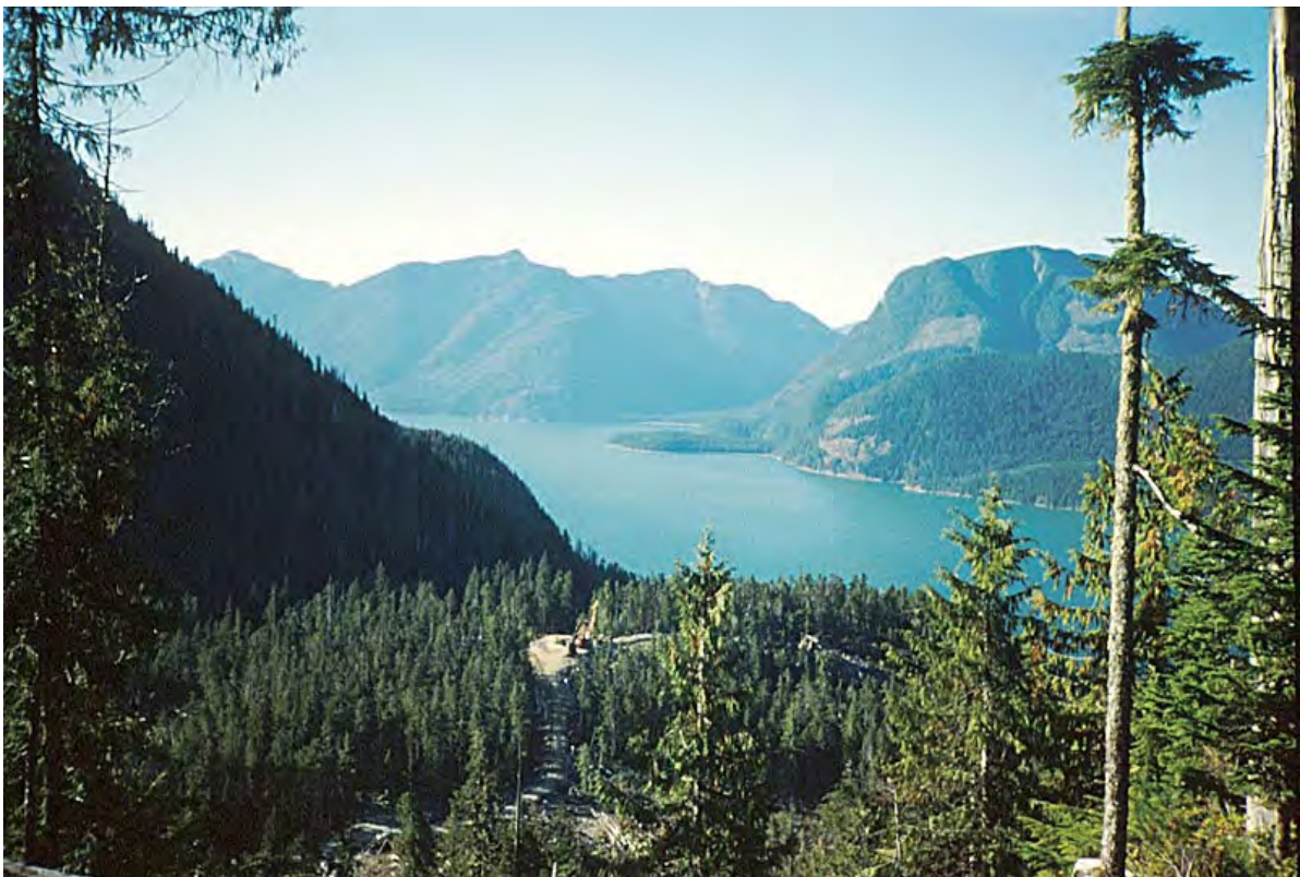
Figure 1: Partial cutting in old growth on visually sensitive landscapes in Coastal British Columbia, Canada.

Alternative systems or methods are often used to harvest these areas (Krag, 1991; Bennett & Eng, 1996; Stokes & Schilling, 1997; Sauder, 1998). Logging systems, equipment and practices are considered 'alternative' if they differ from the usual conventional methods and can include practices such as helicopter logging, wide-tyred skidders, and long-distance cableway systems. Alternative systems can provide options to harvest sensitive areas to environmentally acceptable standards while achieving a satisfactory economic return. The objective of this literature review was to collate and examine international harvest systems, practices, tools and equipment that allow limited harvesting activities in these environmentally sensitive areas.