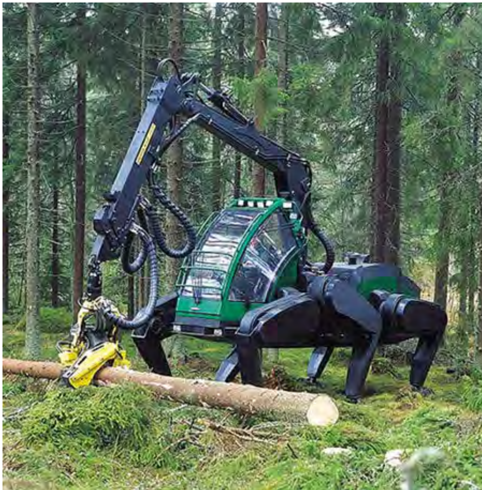
Figure 4: Timberjack walking forestry harvester. www.newlaunches.com . Downloaded 25 th March 2010.

Walking forestry harvesters (Figure 4) have been under development for over 10 years. These six-legged machines have the ability to access difficult and sensitive terrain with a lower footprint than tracked or wheeled machines by optimising the weight distribution over the six foot pads. The machines ability to move in any direction and turn on the spot allows it to access timber in confined areas. It can also sense and step over obstacles in its path. These machines are being promoted as a new technological solution for harvesting steep country, (Billingsley, Visala & Dunn, 2008). However they are not in use commercially and would need to consider remote control in situations too risky for human operators in the cab.