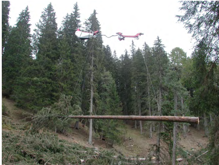
Figure 10: Long-distance cableway system in Europe using a Valentini 1500 tower with a newly designed Seik carriage allowing full tree suspension.

Figure 10 shows a long-distance cableway system in Europe with a new Seik carriage developed for forestry operations. The double hoisting winch allows full tree suspension in sensitive areas.