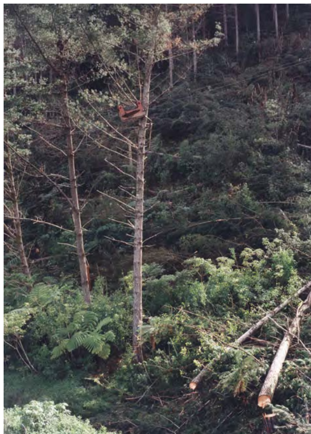
Figure 14: Felling along a stream edge using a batwing

In a comparative study of four techniques to fell streamside trees in a ground-based operation, the two machine-assisted felling techniques (an excavator with a grapple head and a skidder winch) were more productive, safer and achieved higher environmental standards than motor-manual felling and motor-manual felling using tree jacks (Baillie & Kirk, 1997). However the machine assisted felling techniques were more costly to use.