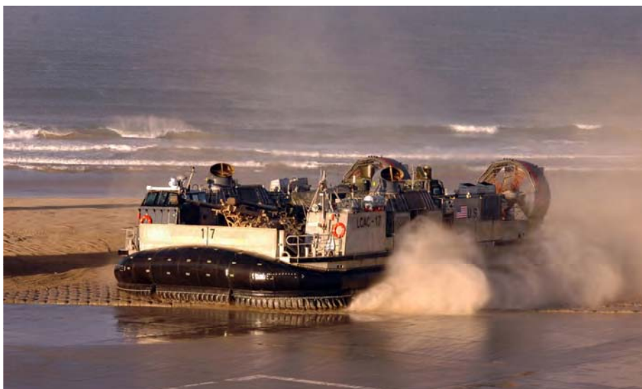
Figure 6: An air-cushioned landing craft at Camp Pendleton, California, U.S.A.