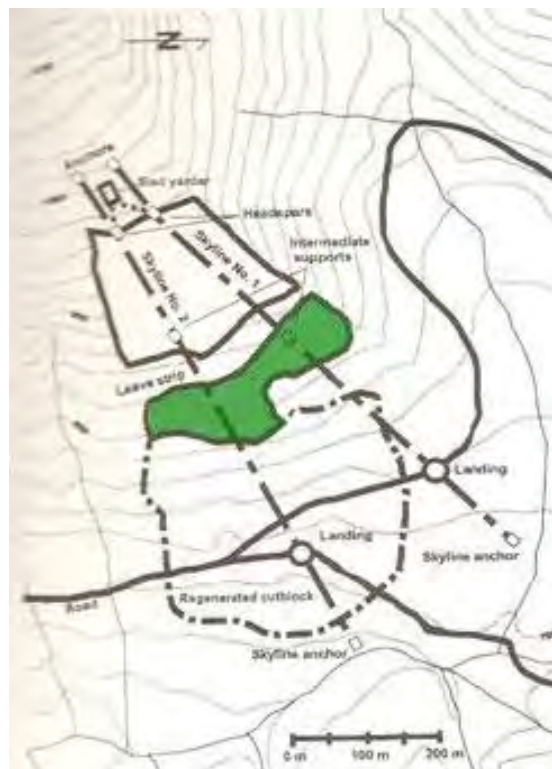
Figure 9: Example of a long-distance cableway plan (Bennett & Eng, 1996)

Long-distance cable way systems are used extensively in Europe (Bennett & Eng, 1996) and have been used in North America since the 1950's in areas where environmental constraints or difficult terrain prohibit or limit roading networks to support more conventional tower systems. A standard configuration for a long-distance cableway system includes a sled yarder or winch, fitted with the mainline, positioned at a high point in the block alongside, but offset from the skyline (Figure 9). Intermediate supports are often used to provide additional elevation above the terrain. The mainline runs from the yarder through a block on the skyline down to the carriage. Logs are suspended under the carriage and travel under gravity down to the landing.