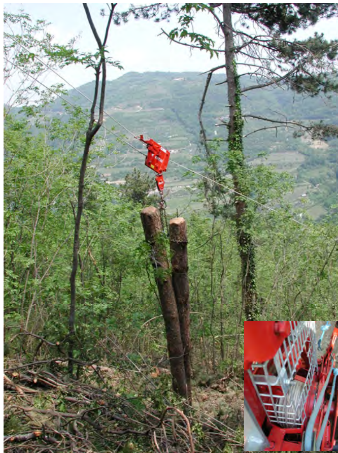
Figure 8: Timber extraction using a mini-yarder in Italy equipped with synthetic rope.

While skyline systems are traditionally used on steeper terrain, they have been modified and trialled for use in wetland areas in Canada, USA, Colombia and Papua New Guinea (Aulerich, 1990). Most operations involve motor-manual felling, and for smaller stems, manual preparation of logs into bundles for extraction. In Colombia, two modified skyline systems (modified North bend and a skyline rigged in the Tyler configuration) worked together to extract bundles of wood to a road side. A standing skyline system with a double-tree support was used in Oregon to extract timber from the wet area with numerous drainage ditches and dykes and in Ontario Canada, partial harvesting in flat water logged areas was achieved with a Highland Trailer Alp yarder. In Papua New Guinea, high rainfall and sensitive soils required most skid roads to be corduroyed. The use of a live skyline system with intermediate supports to gain lift over the terrain and extend lateral yarding capabilities, reduced the roading network required to harvest the block (Aulerich, 1990). In most instances these systems appeared to be handling small piece sizes. High lead cable logging on flat wet areas was used in New Zealand up until the mid-1980's to extract timber from areas unsuitable for ground-based operations (pers. comm., P. Hall, Scion).