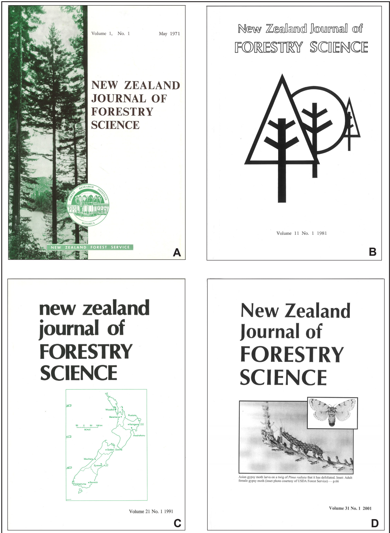
FIGURE 2: Cover designs for four different issues of the New Zealand Journal of Forestry Science . (A): Volume 1, Issue 1, 1971; (B) Volume 11, Issue 1, 1981; (C) Volume 21, Issue 1, 1991; and (D) Volume 31, Issue 1, 2001.