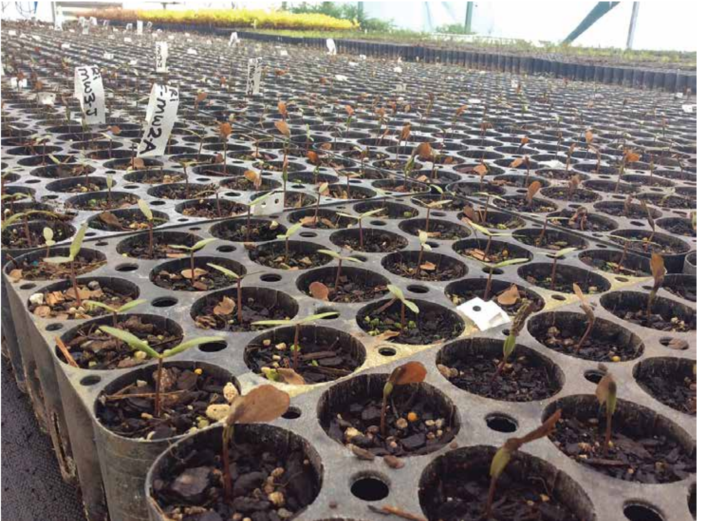
Family lines of kauri seedlings germinated at Scion's research nursery in preparation for screening with Phytophthora agathidicida .