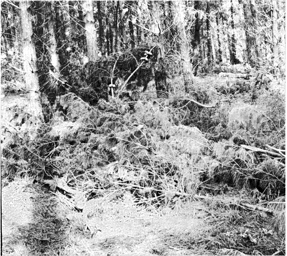
FIG. 3—Slash left after motor-manual thinning.

Bark removal: The Logma removes some bark during the delimiting process. We estimate that this saves about 1–2% in cartage costs through a reduction in the volume of bark carted, and it leaves more nutrients on site for recycling to the remaining trees. The proportion of bark removed varies with the season of the year, but during the spring it appears to be as high as 25% removed.