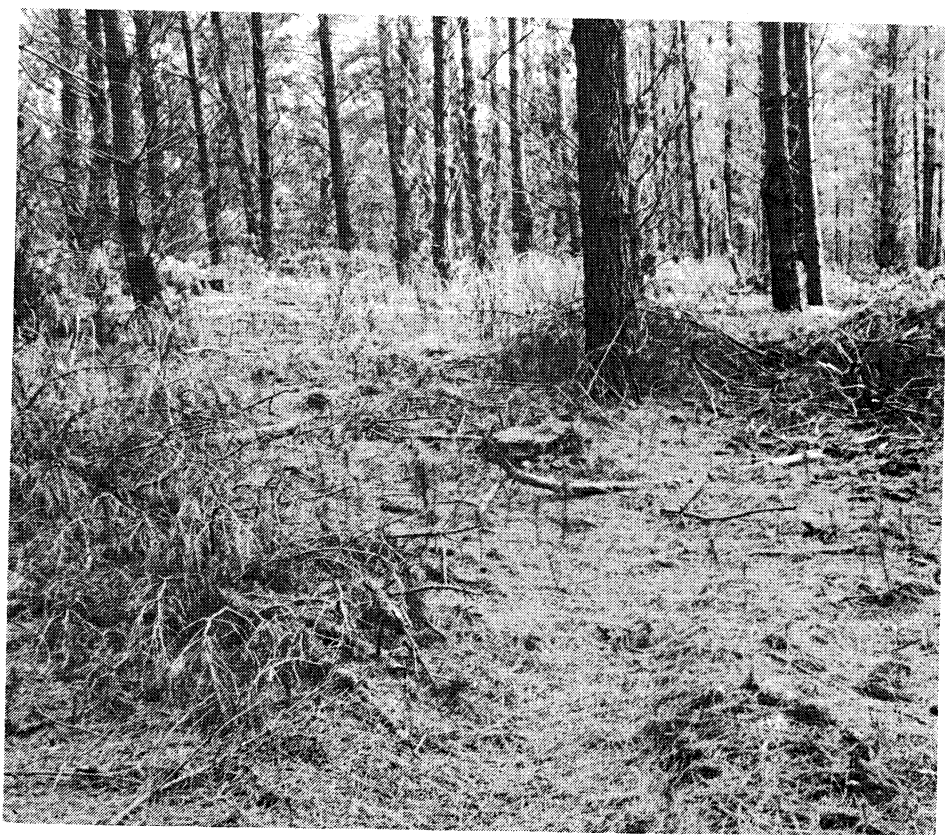
FIG. 2—Crushed slash in a stand thinned with the Kockums system.