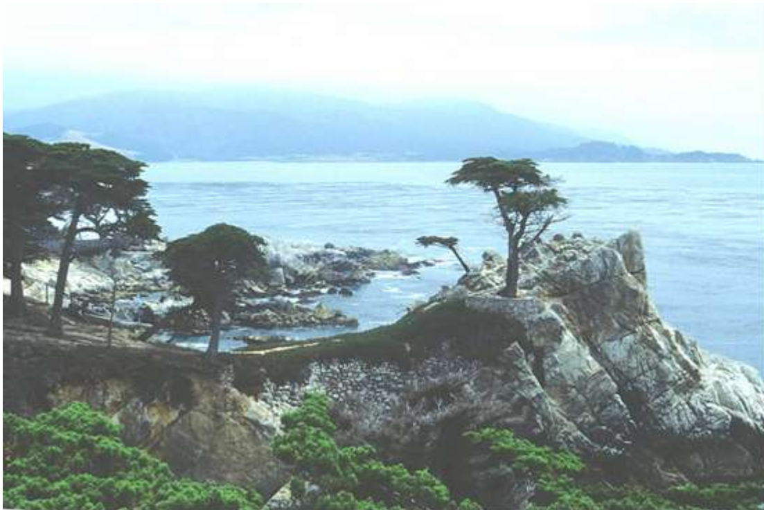
Lone cypress ( macrocarpa ), Cypress Point, California

proved highly inter-fertile. They were often planted as individuals or in small groups of each species, thus creating opportunities for natural hybridization. The most important species for local industry are lusitanica and macrocarpa . Lusitanica has become more important in the last couple of decades due to its greater resistance to cypress canker.