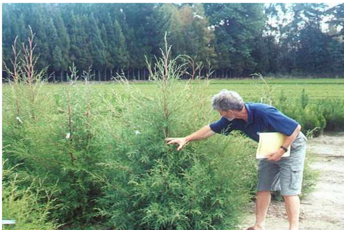
Lusitanica stool plants just prior to taking cuttings, Forest Research nursery, Rotorua.

more likely to be cloned en masse . However, these easily propagated genotypes don't necessarily have the best characteristics for end product traits. Cypress growers need to ascertain that clonal planting stock is from clones which have a proven field performance in extensive clonal field trials, rather than clones that are merely easy to propagate.