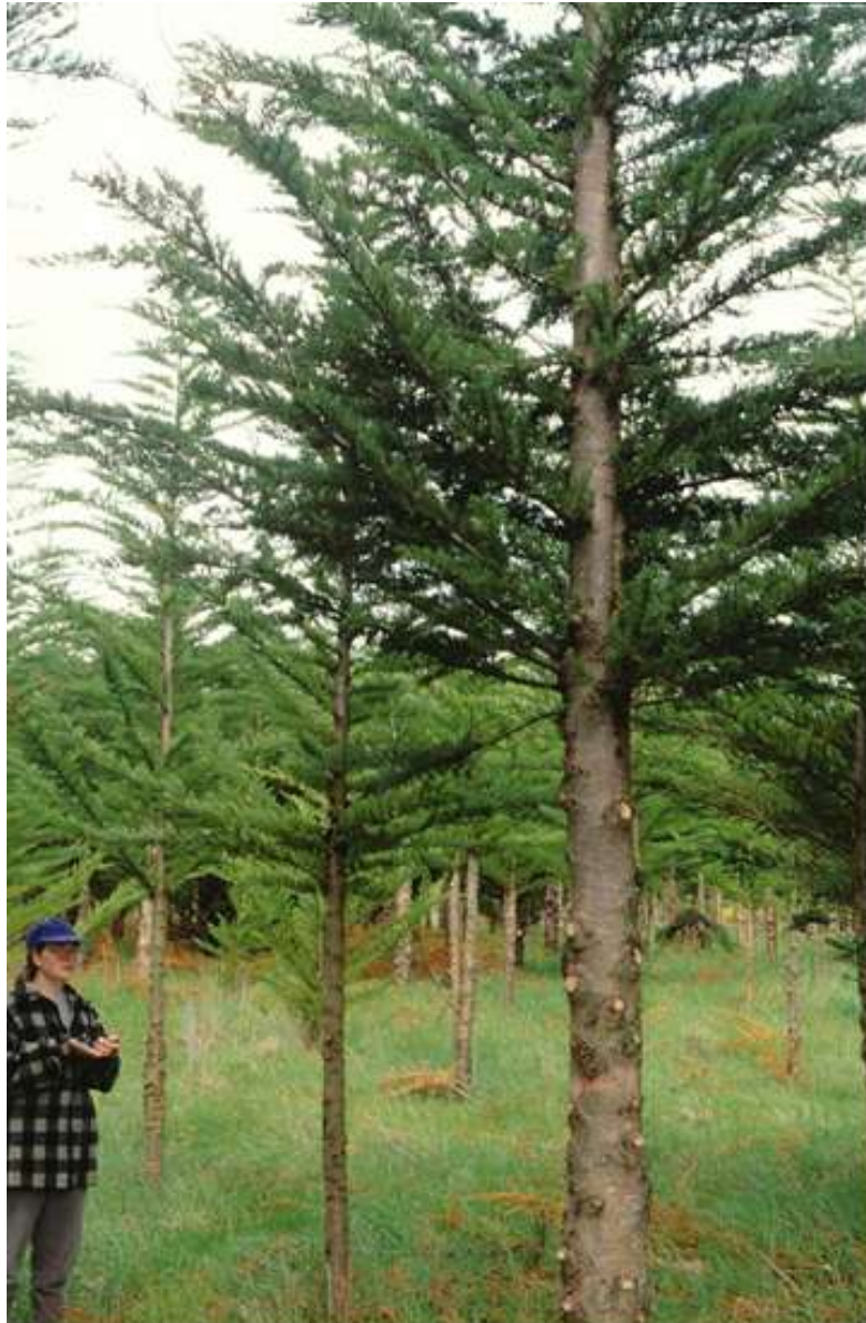
Good form macrocarpa

have been planted from these collections. Unfortunately, the good health of the Longwoods seed stand was due to the cool climate and not genes for resistance to the cypress canker, so some descendent stands have been badly hit by canker.