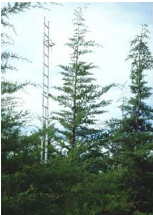
Good form lusitanica, age 9 years, Hawke's Bay

Lusitanica has an extensive natural range from Mexico down through Guatemala, although it is mainly found in scattered stands. Cupressus arizonica is sufficiently closely related to be considered by many as a northern provenance of lusitanica. In Mexico, lusitanica grows in sheltered valleys at high altitude, where it is frequently shrouded by mists. Consequently it is surprisingly well-adapted to cold winters, although it grows faster in the warmer climates of Northland and coastal Bay of Plenty in New Zealand.