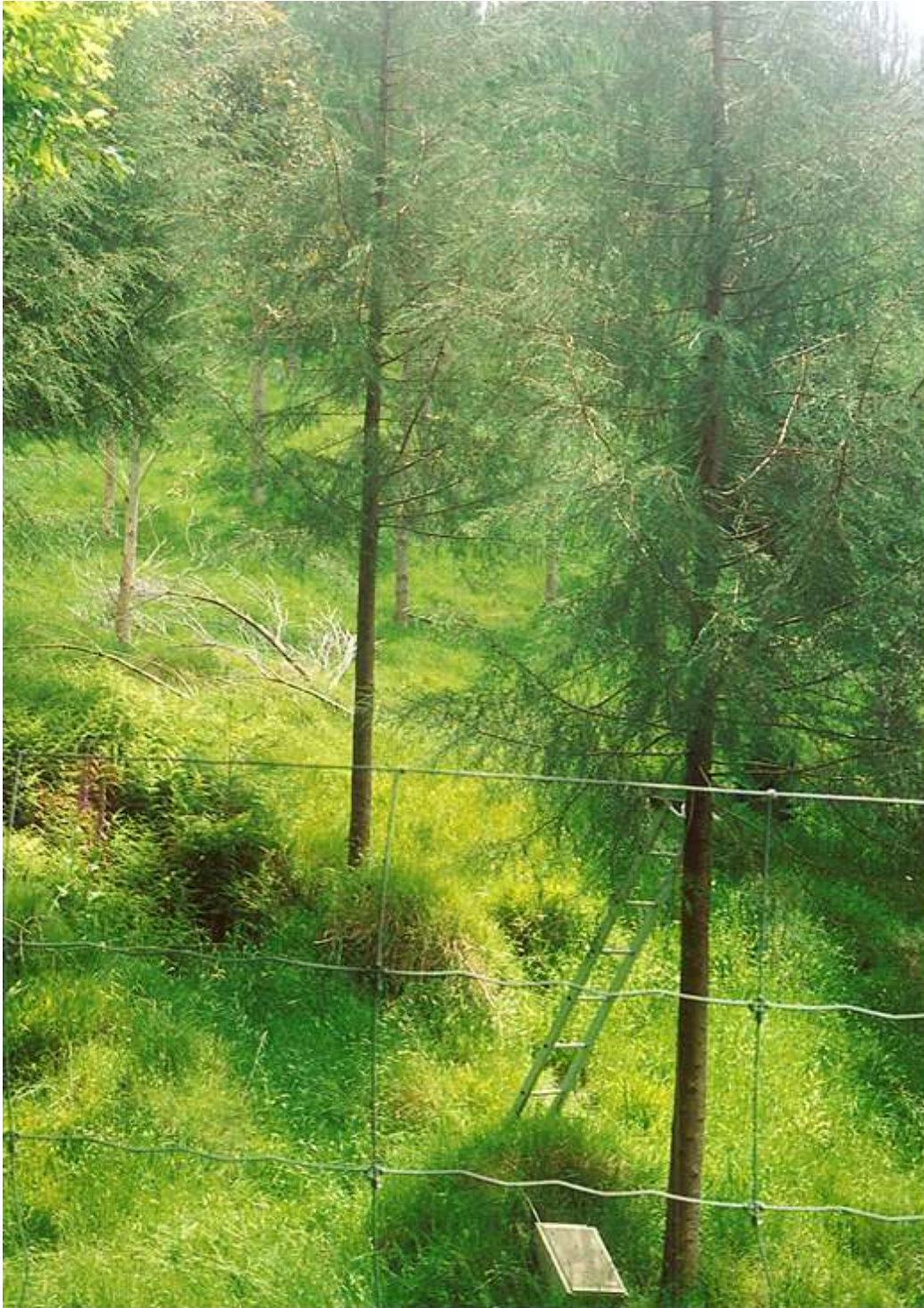
Lusitanica clone exhibiting good form, Paengaroa, Bay of Plenty