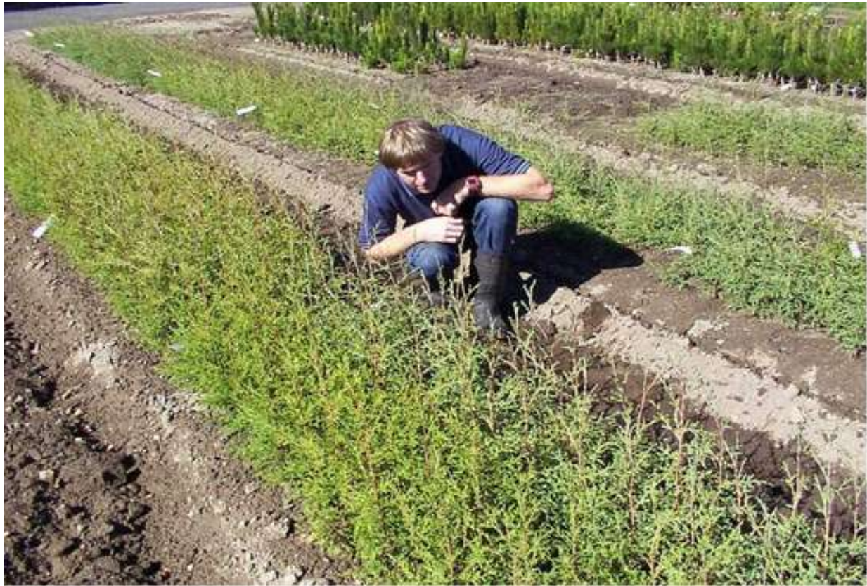
Lusitanica cuttings, ready for planting, Forest Research (Ensis) nursery, Rotorua.

rooted cuttings. There are no published standards, but general recommendations can be made. Growers can ask nursery staff to view the root systems of two or three rooted cuttings, to check that there is a well developed, balanced, fibrous root system. Growers also should check the vigour and juvenility of the shoots. Rooted cuttings should have a minimum diameter of 5 mm and a minimum height of 35 cm. It can be difficult to ascertain maturation (physiological age), but juvenile cuttings will have similar vigour and appearance to seedlings, compared with “aged” rooted cuttings, with an older maturation state, which may have a less upright form and have foliage more akin to that seen on branches of “adolescent” to mature trees.