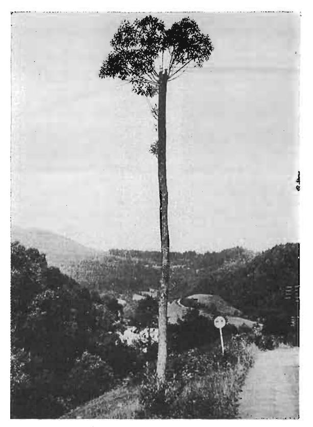
FIG. 3-The rooted stem of Salix fragilis L.

Provided sufficient supplies of moisture are available, even quite short cuttings are capable of rooting well (some cuttings examined were 3 cm in length). In practice, however, the cutting which reaches a depth in the soil where there are sufficient supplies of moisture is most likely to survive. The high-rooting species are able to grow when the "pole", or even the "stem" size of the cutting is used. To prove this, we experimentally planted a "giant cutting" of the head-type willow, 70 cm in diameter, and the trial proved successful (Figs. 3 and 4).