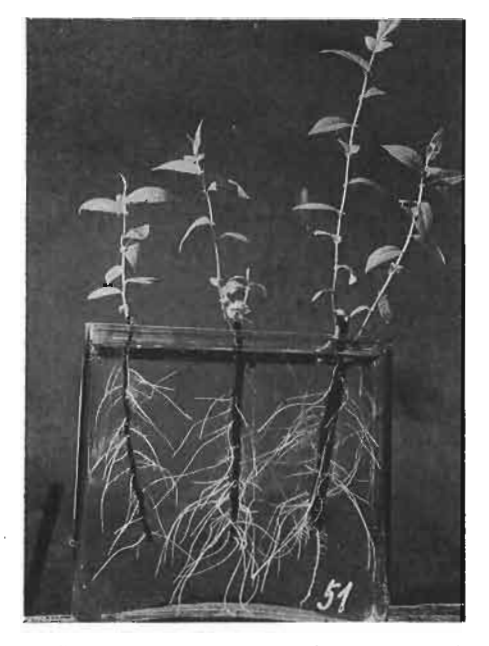
FIG. 1—The diffuse type of rooting (Salix cordata Muehl).