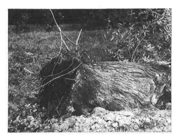
FIG. 4—Three-year-old adventitious roots on a stem of Salix alba L. which is 70 cm in diameter.

vertical or oblique position, and they do so even when placed almost horizontally in the soil. However, there is a risk that the cutting will dry out if planted horizontally and at shallow depth. In the alpine willow species which are characterised by prostrate growth, the vertical position appears to be disadvantageous; in such cases a leafy shoot is sent off from the bottom part, the roots being formed higher on the cutting. It sometimes happens that a shoot formed below ground level will fail to force its way to the surface.