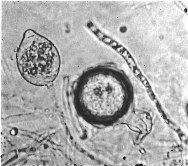
FIG. 2—A papillate sporangium and an oogonium with an amphigynous antheridium of P. heveae