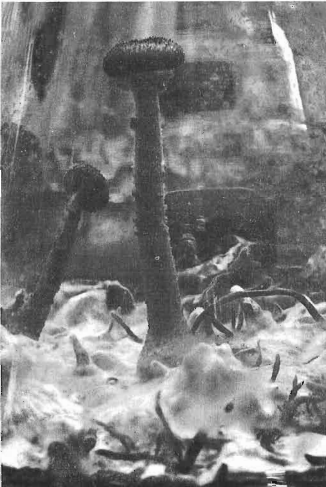
FIG. 2.—Mature sporophores of A. novae-zelandiae produced on artificial medium amended with 0.1 ppm sodium pentachlorophenol. Sporophores formed after incubation in full light for 2-3 months at 20-23°C.

The combination of differences in rhizomorphs and mycelia gives cultures of A. novae-zelandiae a more lobed appearance than those of A. limonea . Two-week-old cultures of A. limonea are red-brown at the centre and white towards the margins when viewed from above, whereas those of A. novae-zelandiae are generally white throughout with, perhaps, reddish-brown islands appearing where rhizomorphs pass through surface mycelium.