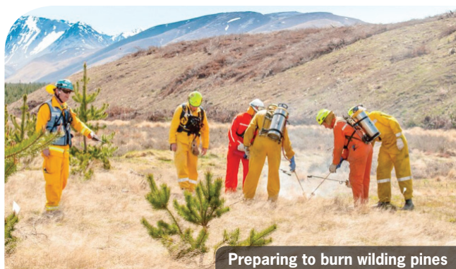
Preparing to burn wilding pines

fires remain under control. These agencies are providing firefighters and equipment to keep the burns within the designated area, but also to quickly contain any fire escape should one occur.