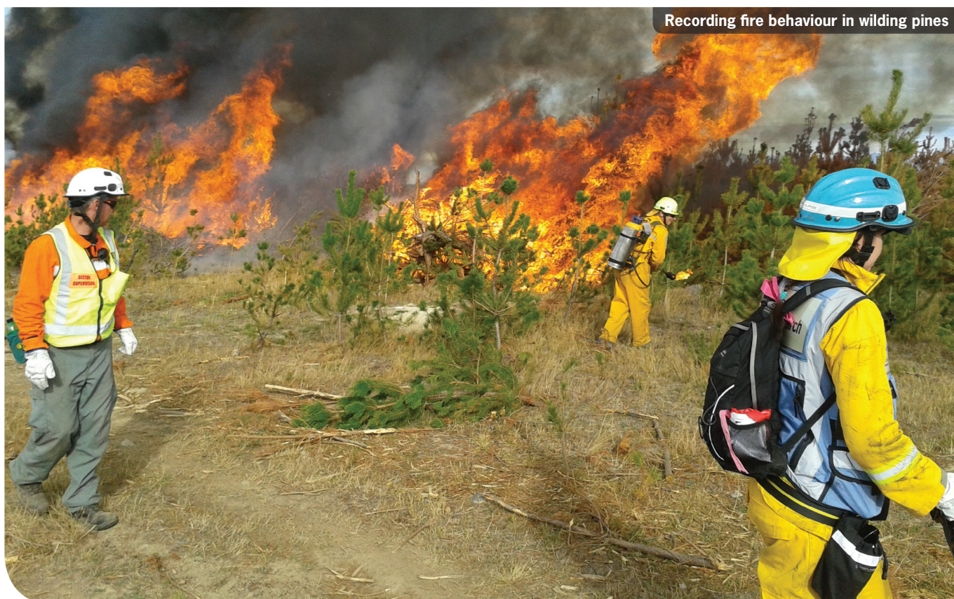
Recording fire behaviour in wilding pines

An experimental burn like this can only be done with the generous cooperation of the stations, local community and local rural fire organisations. In this case we are working with the South Canterbury Rural Fire Authority, Department of Conservation and other fire authorities from across Canterbury to ensure these