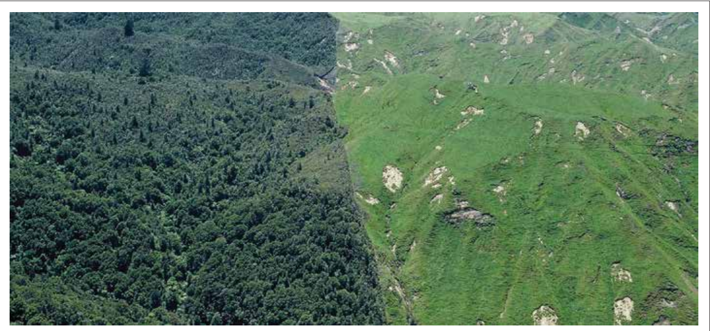
An example of East Coast land showing mixed forest growing on a hillside beside a section of highly erodible land.