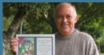
Scion scientist shares Nobel Peace Prize honour. Find out about it on Page 3.