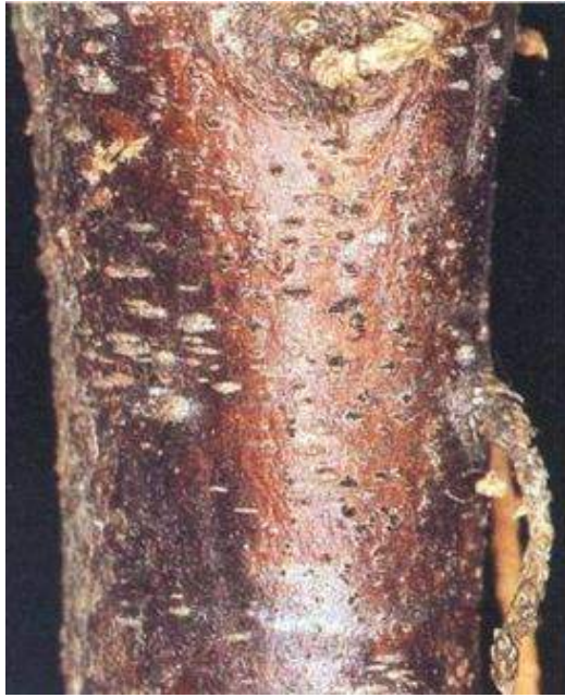
Fig. 3 – Fruiting bodies appear as tiny, black pin-heads on the bark