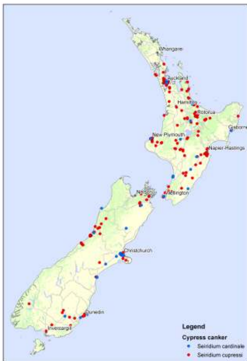
Fig. 6 – Distribution of the cypress canker fungi in New Zealand.