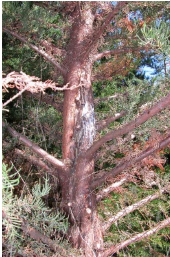
Fig 5. Stem canker showing cracked bark and resin bleeding.