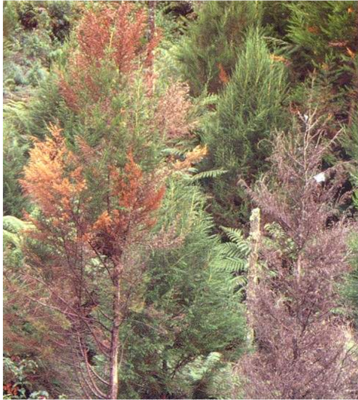
Fig 2 – Severe disease in a young Cupressus macrocarpa woodlot.