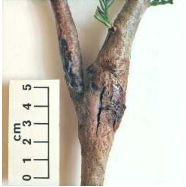
Fig. 4 – Branch canker showing swelling, purple discoloration, cracked bark and resin bleeding