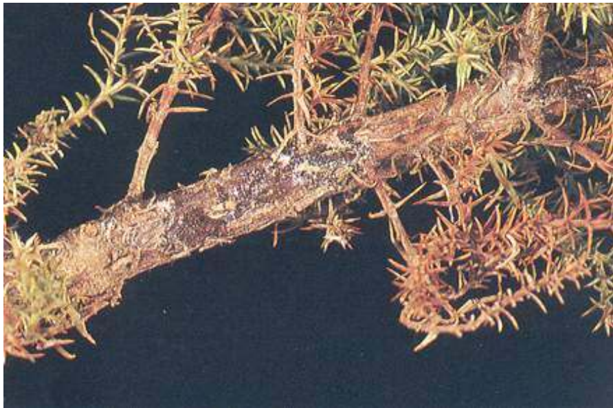
Fig. 7 – Resinous exudate on stem of Cyprinus macrocarpa seedling infected with Seiridium cupressi

As a precaution against planting out diseased stock, trees should be examined before leaving the nursery so that any trees with symptoms of cypress canker can be destroyed.