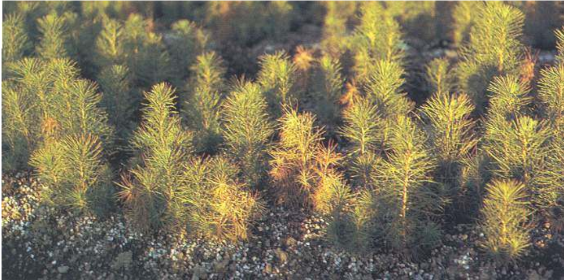
Fig. 11 – Root-rot induced mortality in a Pinus radiata nursery bed.

Cylindrocladium scoparium may infect both developing roots and the lower stem. Conditions for growth and development of this fungus are as described for "Damping-off".