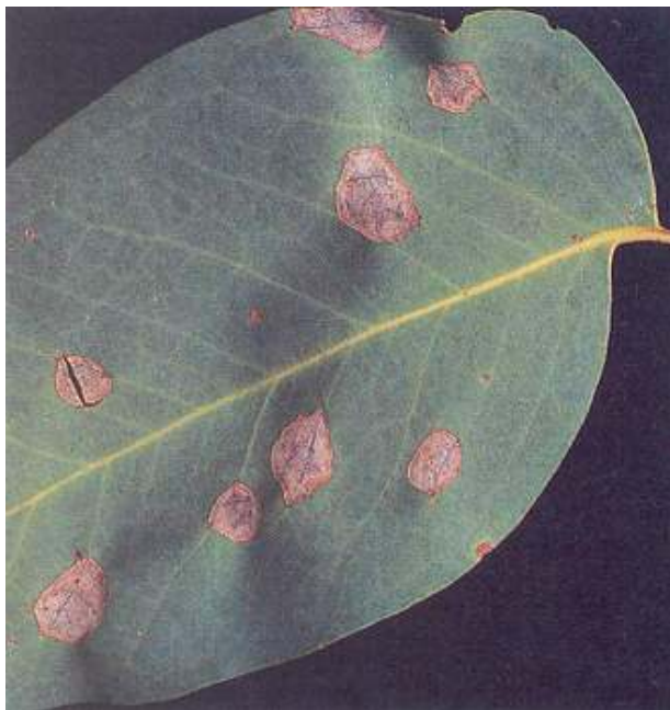
Fig. 8 – Leaf lesions on Eucalyptus delegatensis caused by Mycosphaerella cryptica .

Control can be achieved by fortnightly applications of chlorothalonil e.g. 2l Bravo Weatherstik (500g/l of chlorothalonil), and 0.33 litres of wetting agent in 1000 litres of water per hectare.