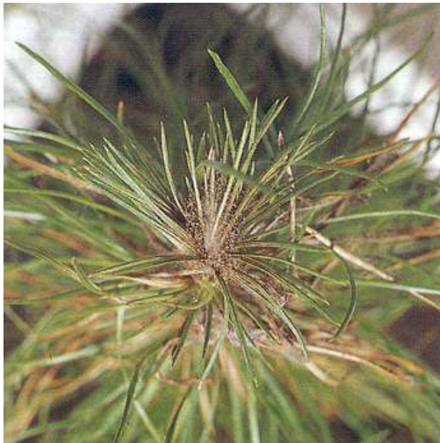
Fig. 9 – Fungal strands and grey powdery fruiting bodies of Botrytis cinerea on the infected tip of a Pinus radiata seedling.