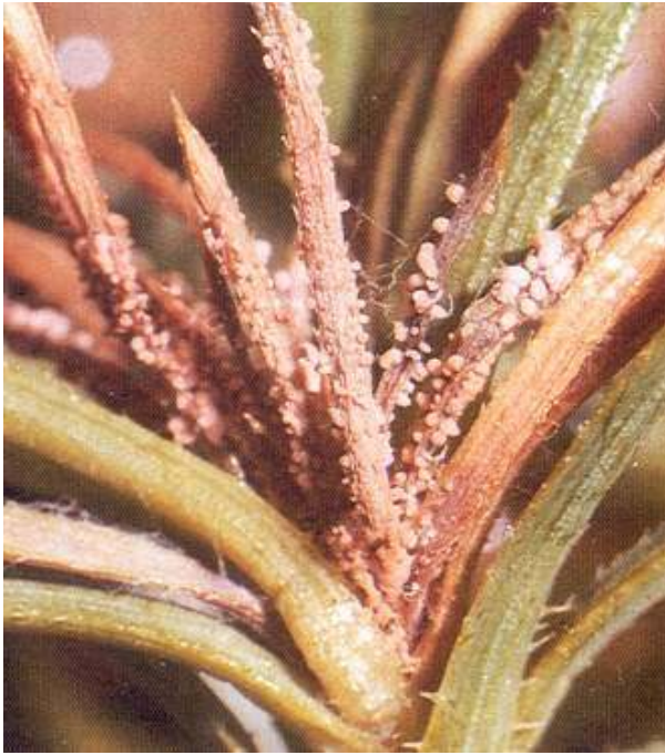
Fig. 4 - Pink pustules of the "terminal crook" fungus on infected needles of Pinus radiata .