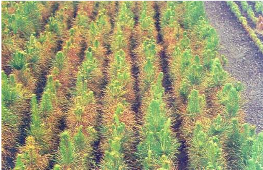
Fig. 2 – Pinus radiata seedlings with basal needles infected with Dothistroma pini .

infected needle usually dies and turns brown. Generally only the lower needles are affected (Fig. 2). If seedlings are left to over-winter in the nursery, infected needles may fall off.