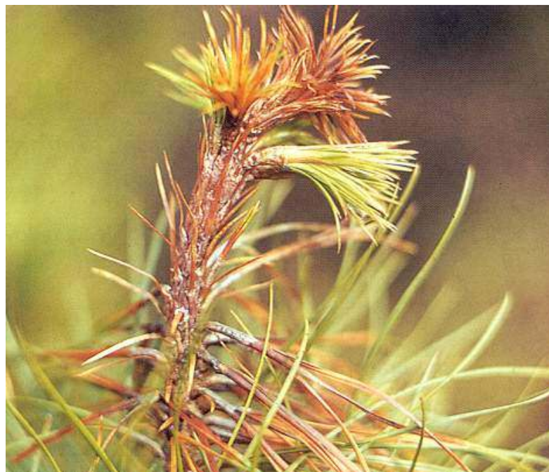
Fig. 6 – Dead brown tip of Pinus radiata infected with Diplodia pinea .