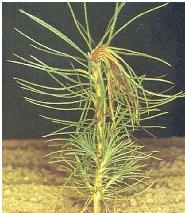
Fig. 3 - Pinus radiata seedlings showing the typical "terminal crook" symptom.

The disease has been recorded in the North Island and in Nelson.