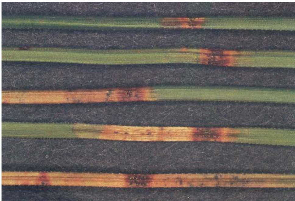
Fig. 1 - Pinus radiata needles with brick-red bands and black Dothistroma fruiting bodies.

Larix decidua , Picea sitchensis , Pinus aristata , P. attenuata , P. ayacahuite , P. canariensis , P. contorta , P. coulteri , P. densiflora , P. elliotii , P. greggii , P. halepensis , P. hartwegii , P. jeffreyi , P. lambertiana , P. michoacana , P. montezumae , P. monticola , P. muricata , P. nigra , P. patula , P. pinaster , P. ponderosa , P. pseudostrobus , P. radiata , P. resinosa , P. roxburgii , P. sabiniana , P. serotina , P. strobus , P. sylvestris , P. taeda , P. thunbergii , P. torreyana , Pseudotsuga menziesii .