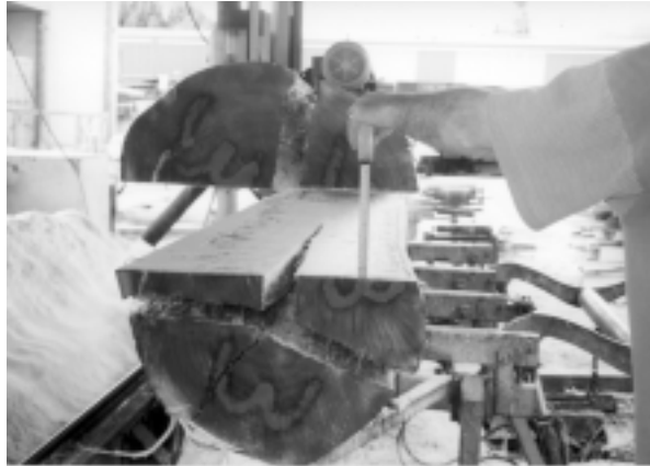
FIG. 3—Assessment of spring occurring at the first saw cut in Tree 24.

The boards were then kiln-dried, using a schedule of 70°C wet-bulb/55°C dry-bulb, for 95 hours. This was followed by kiln reconditioning involving steaming for about 2 hours and then slowly reducing humidity. The kiln-dried boards were cross-cut into two 2.2-m boards, and ripped to remove wane and knots, to nominal board widths of 50, 75, 100, 125, 150, and 200 mm.