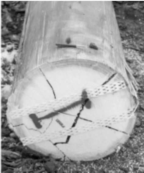
FIG. 4—End-splitting in peeler log (left) and sawlog (below) of Tree 24.

centre of the log (near 70°C on the outside). One second log (Tree 24) with severe end-splitting (Fig. 4) was not peeled. Some veneer logs were not completely submerged in the tank and their identity was recorded. The five butt and 14 second logs were then each cut into two 2.6-m billets which were peeled on a rotary peeler lathe to a core diameter of 180 mm to produce sheets 2.6 mm thick, 1.2 m wide, and 2.4 m long. Residual 180-mm cores were each cross-cut into two 1.3-m billets and then peeled to 90 mm diameter on a smaller lathe. Sheets were numbered in sequence from the outside of the log. Dried sheets varied a lot in thickness and moisture content, with an average of 18%, and a range of 6–60% (mould occurring on some sheets). Thickness, measured on each side of the sheet, varied both between and within sheets — average thickness 2.5 mm (standard deviation (s.d.) 0.14 mm), and average within-sheet range 0.15 mm.