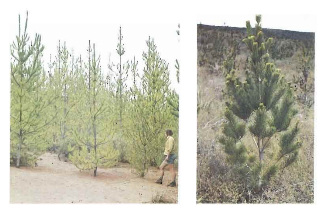
FIG. 3 (left)—Group of N deficient trees on sand blow-out area, Woodhill Forest. FIG. 4 (right)—Phosphorus deficiency symptoms on young tree, Riverhead Forest.