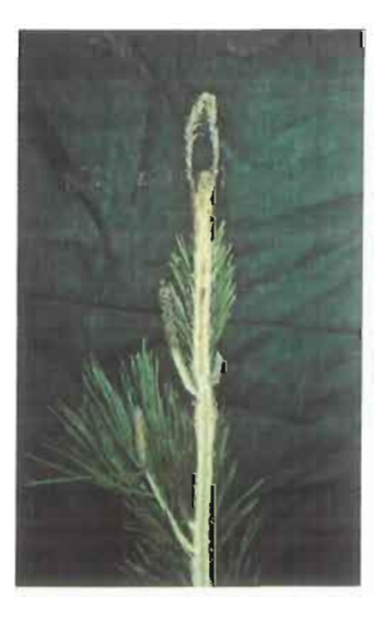
FIG. 5 (left)—Magnesium deficiency symptoms in recently thinned and pruned stand, Kaingaroa Forest. FIG. 6 (right)—Longitudinal section of boron deficient shoot.