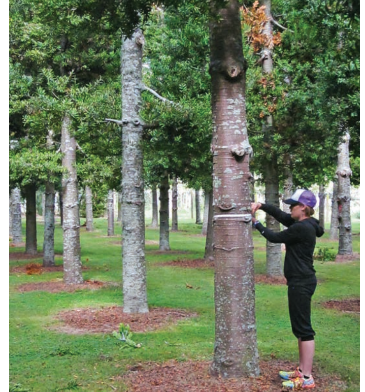
A 17-year old kauri stand in the Bay of Plenty

Internal rates of return of four to eight per cent have been shown from rotations of 60-80 years with early value recovery from commercial thinnings.