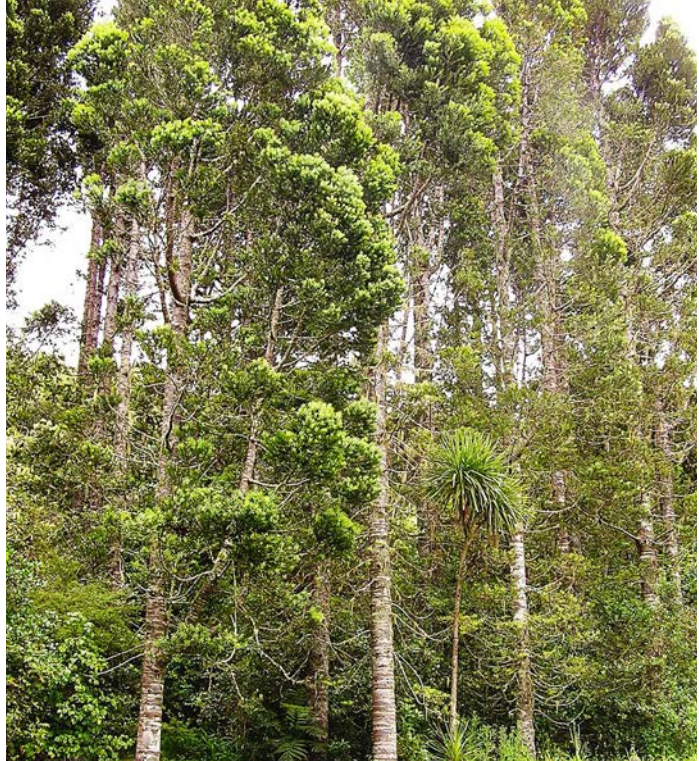
Kauri at 40-years old