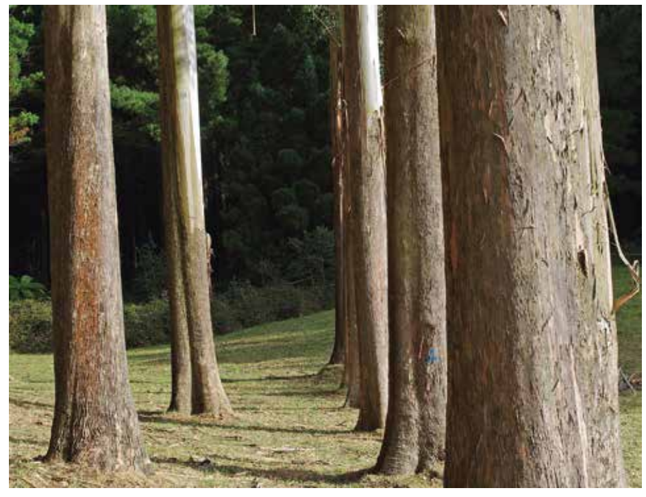
The opportunity exists to expand the market for locally grown eucalypts.