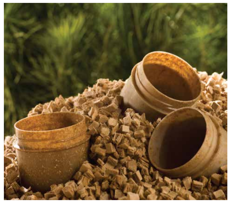
Bioplastics are a rapidly growing market.