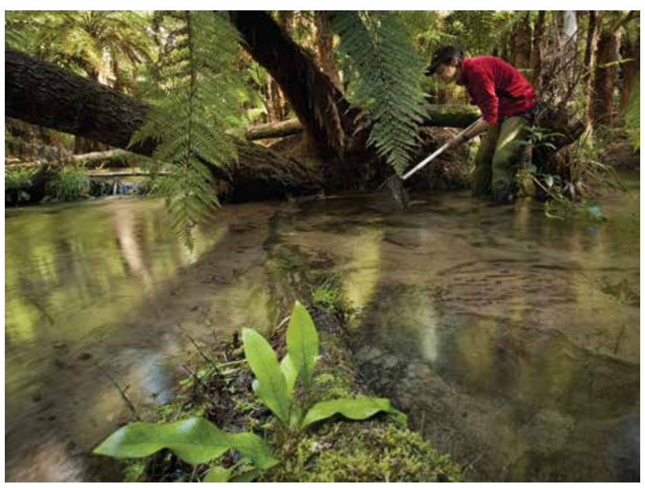
Increased intensification must be within environmental limits.