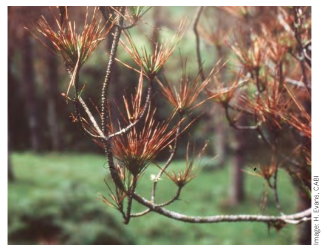
Symptoms on P. radiata showing lion's tail appearance.