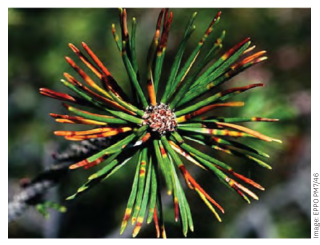
Symptoms on Pinus mugo<sup>2</sup>.

Brown spot needle blight (BSNB) is a disease of pine species caused by Lecanosticta acicola. This disease is not present in New Zealand. Help us keep BSNB from establishing here by learning what to look for.