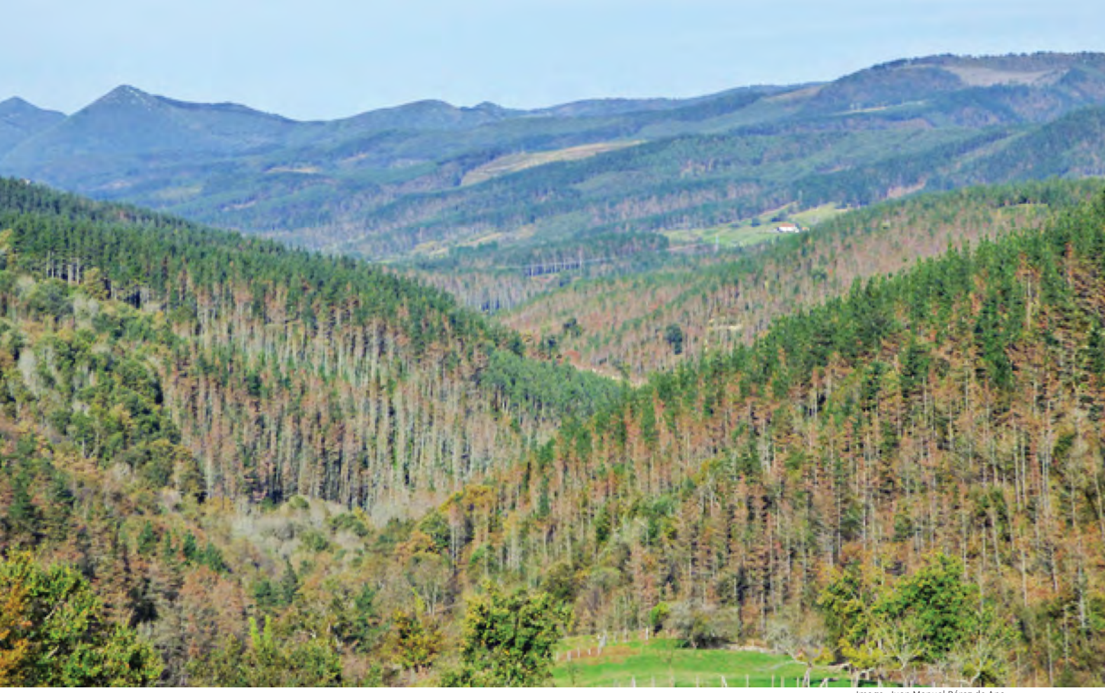
L. acicola on Pinus radiata in Spain<sup>1</sup>.