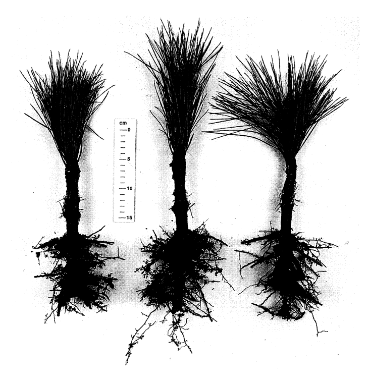
FIG. 2-Graft stubs ready for planting

Open-bed-grown P. radiata grafts are normally conditioned by undercutting, wrenching, and lateral root pruning, as described for P. radiata seedlings by van Dorsser & Rook (1972). In this trial the start of conditioning was delayed and graft stubs were not undercut until immediately after removal of the cuttings. By July 1988 the graft stubs were adequately conditioned and the remaining root-stock foliage was removed. By this time buds had developed in the uppermost fascicles and root systems were adequate despite the late conditioning (Fig. 2).