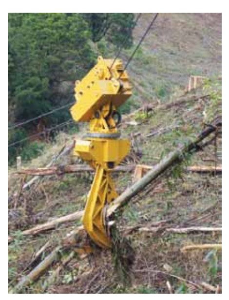
The hydraulic-based hauler grapple.

"The grapple builds hydraulic pressure as it moves up and down the cables, which is used to manipulate the grapple arms," says Spencer Hill, research leader for harvesting and logistics. "The nonmotorised operating system makes it lighter, low cost and cheaper to run than conventional, motorised models.