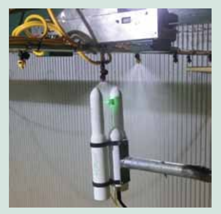
Measuring spray droplets.

The sprayer boom can currently reach speeds of up to 18 km/hr, with the 12 metre track able to be extended in the future to allow for greater speeds that better represent aerial spray applications. The track sprayer gives scientists the ability to adjust spray release speed, droplet size, canopy type and density. Using dye tracers and artificial collectors, scientists can determine droplet penetration and spray deposition in and on plant canopies.