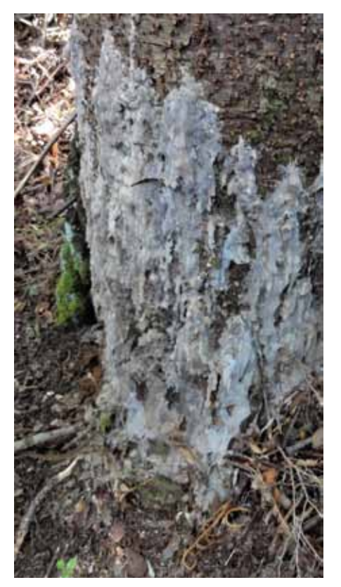
Sap bleeding lesions on kauri trunk.

"The first signs of the disease are often bleeding lesions on the trunk, yellowing and thinning of the canopy and dead branches, but again, this can differ between sites. It's just devastating seeing a 900 year old tree turn yellow and die."