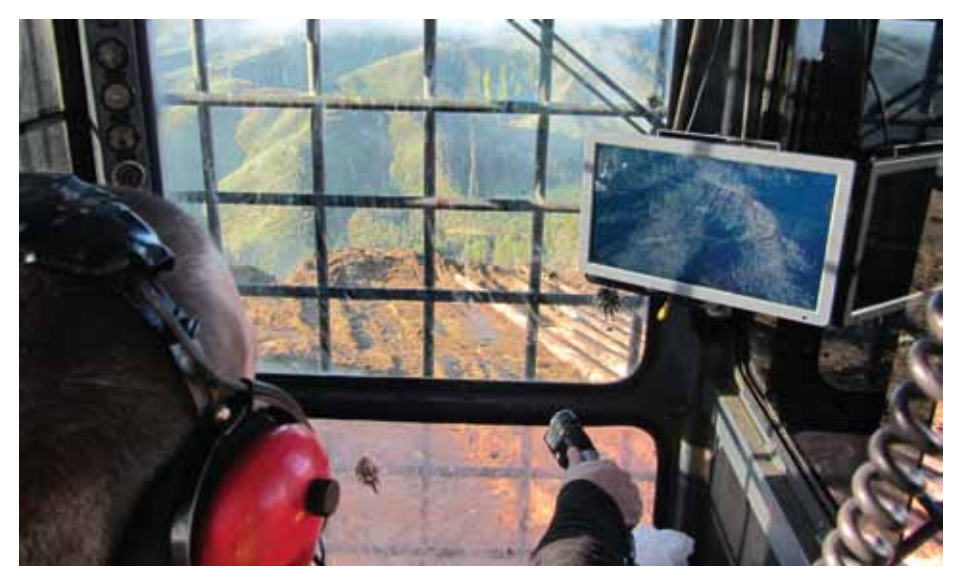
The CutoverCam emits high frequency video of ground operations back to the hauler operator.