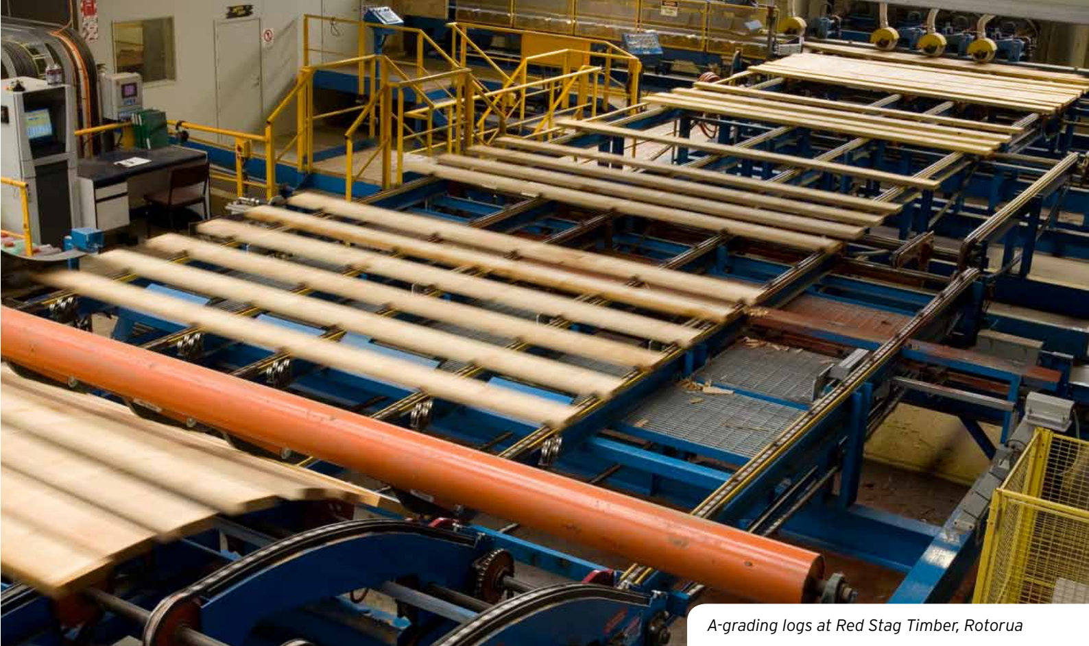
A-grading logs at Red Stag Timber, Rotorua