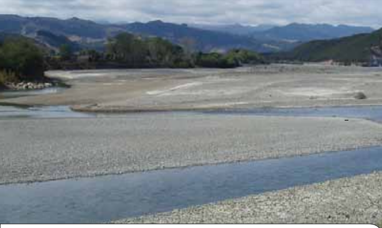
The Waiapu River has the highest sediment loading of any river in New Zealand and the flow on effect for the community is huge.

Erosion, low incomes, poor infrastructure and population migration leave many rural communities in New Zealand vulnerable to climate related impacts, and unable to take advantage of opportunities for a better future.