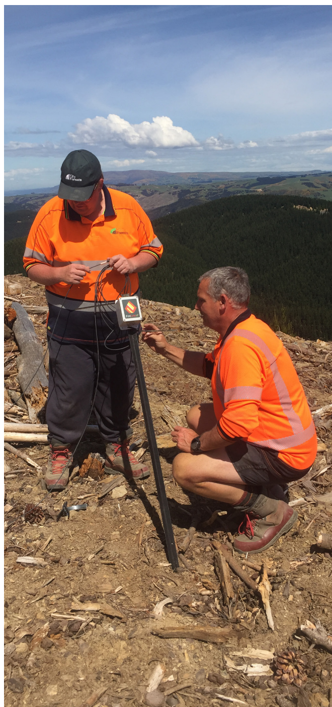
Setting up communications system for temperature probe.

Wenita staff deployed and monitored the probes in their forests to assess the risk of spontaneous combustion in 11 debris piles. The probes found six very hot piles with the hottest internal pile temperature in excess of 90°C with a high risk of spontaneous combustion.