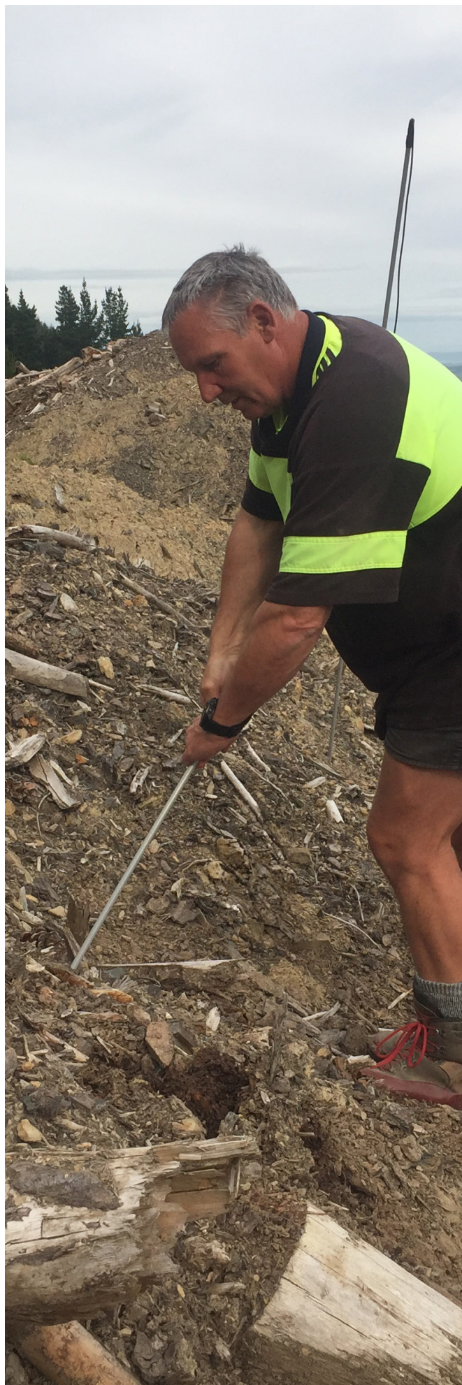
Temperature probe inserted into debris.