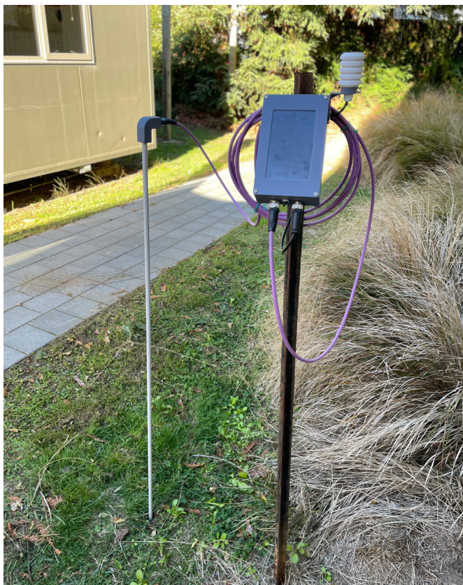
Probe and electronics enclosure with solar panel.

Develop a debris pile temperature monitoring system that can send near-real time temperature readings from locations that have cellular coverage.